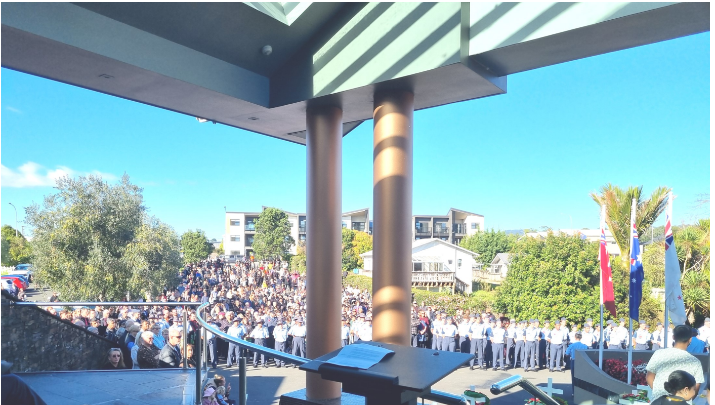
Fantastic Support from our Local Community & Military Alliances